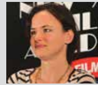
Juliette Lewis Actress