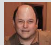
Jason Alexander Actor/Comedian