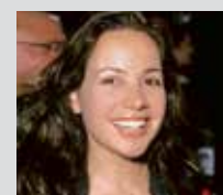
Janeane Garofalo Actress