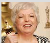
Thelma Schoonmaker Editor