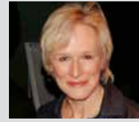
Glenn Close Actress