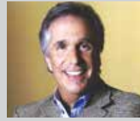
Henry Winkler Director