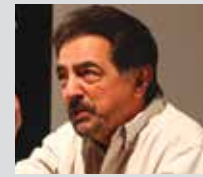
Joe Mantegna Actor