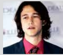
Joseph Gordon-Levitt Actor