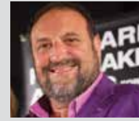
Joel Silver Producer