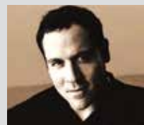
Jon Favreau Director/Writer/Actor