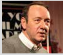
Kevin Spacey Actor