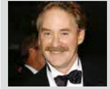
Kevin Kline Actor