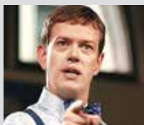
Dylan Baker Actor