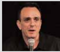
Hank Azaria Actor