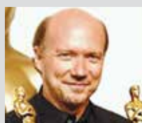
Paul Haggis Writer/Director