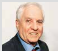
Garry Marshall Producer/Director/ Writer/Actor