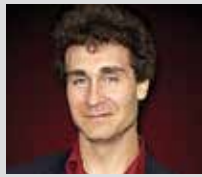
Doug Liman Director/Producer