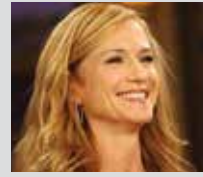
Holly Hunter Actress