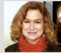
Mary Kay Place Actress