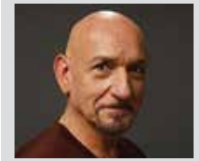
Sir Ben Kingsley Actor