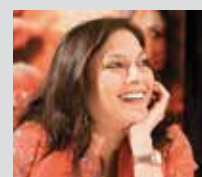
Mira Nair Director