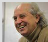
Vittorio Storaro Cinematographer