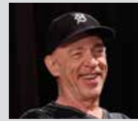
J. K. Simmons Actor