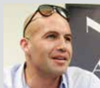
Billy Zane Actor