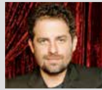
Brett Ratner Director