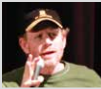
Ron Howard Director