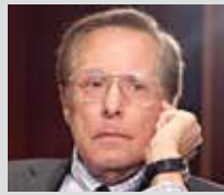
William Friedkin Director