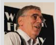
Elliott Gould Actor