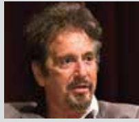
Al Pacino Actor