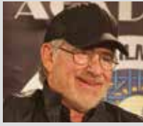
Steven Spielberg Director