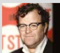
Kenneth Lonergan Director/Screenwriter