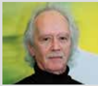
John Carpenter Director