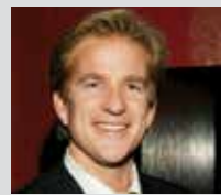
Matthew Modine Actor