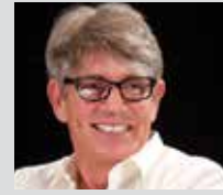
Eric Roberts Actor