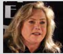
Kathleen Turner Actress