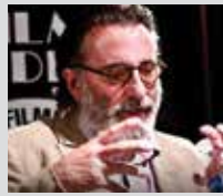
Andy Garcia Actor