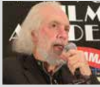
Robert Towne Screenwriter