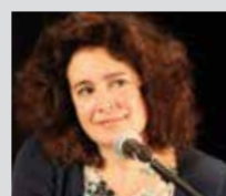
Sean Young Actress