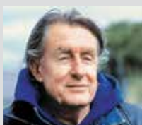
Joel Schumacher Director