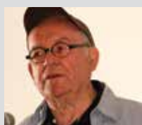
Buck Henry Screenwriter