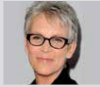
Jamie Lee Curtis Actress