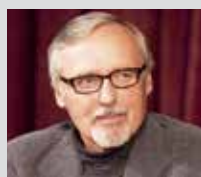
Dennis Hopper (1936-2010) Actor