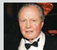
Jon Voight Actor