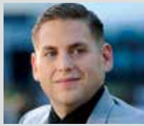
Jonah Hill Actor