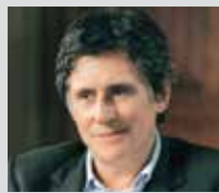
Gabriel Byrne Actor