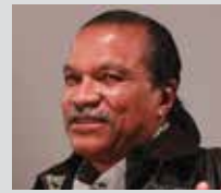
Billy Dee Williams Actor