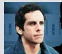
Ben Stiller Actor