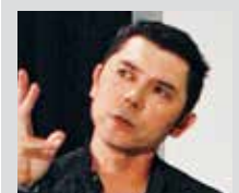
Lou Diamond Phillips Director/Actor